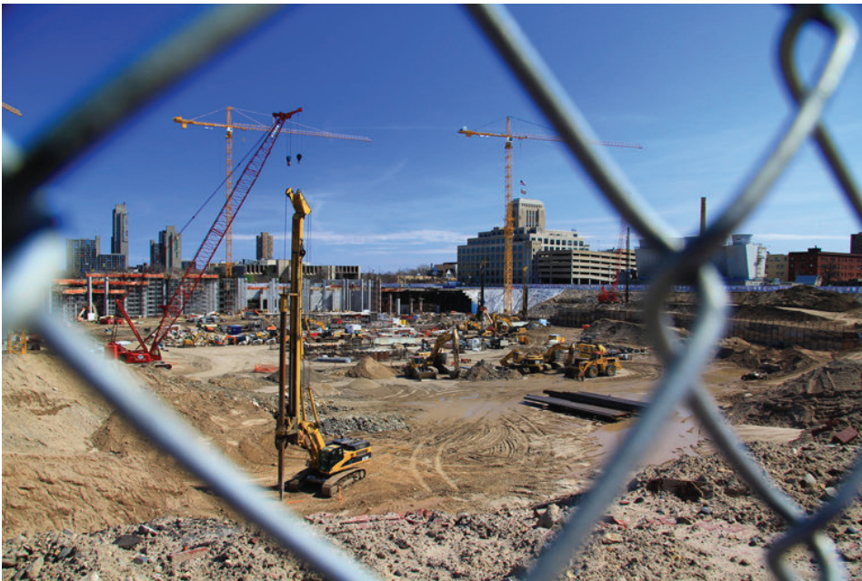
Municipals bonds helped finance the construction of the new Minnesota Vikings stadium.